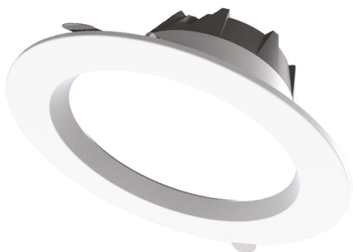
DWL60 / 061