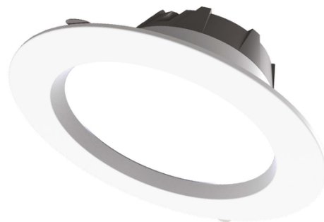
DWL062 / 063